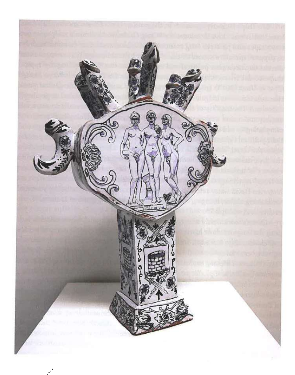
Nicki Green, It's Almost as if We've Existed (Tres in Una), 2015. Glazed earthenware, 15 \frac{1}{2} × 12 × 3 \frac{1}{2} in (39.4 × 30.5 × 8.9 cm).